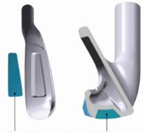
Tungsten weights 20g

The use of 20g of tungsten sole weighting, combined with a wider sole yield a deeper and lower center of gravity. The wide sole also improves turf interaction from any lie.